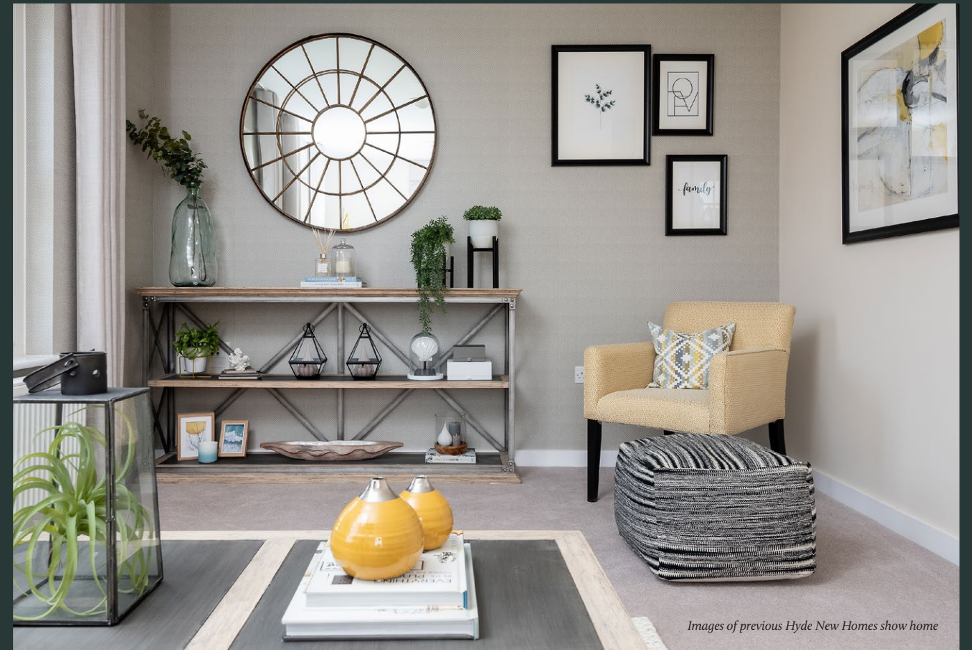
Images of previous Hyde New Homes show home

*Please note that these will be dependent at time of reservation and the build programme status. Ask the Sales consultant for further details.